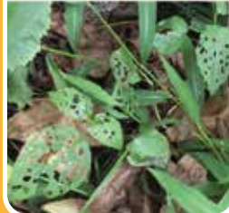
A LEAF WITH HOLES