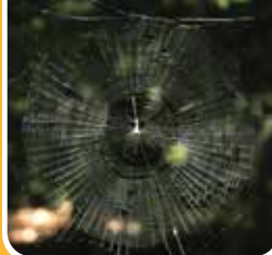
A SPIDER WEB